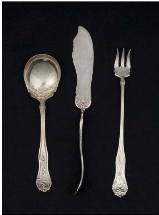
This sugar spoon, butter knife, and pickle fork are silver plate not sterling silver. They were well used and most of the silver worn off. They have been replated.