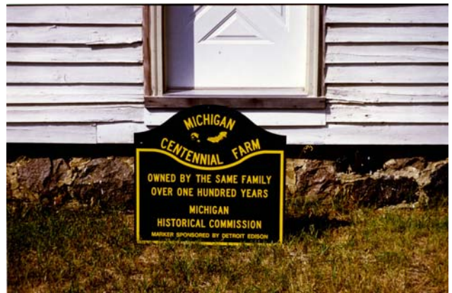
Michigan Centennial Family Farm