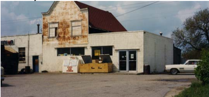
1975 Little Store