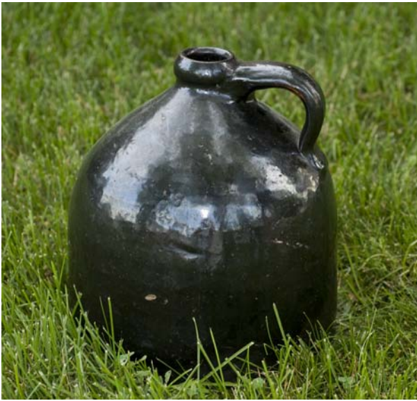
The jug dates to at least around 1900. It was used to carry water to the fields.