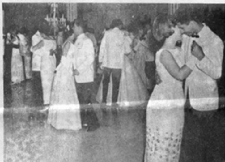
AT LEFT, COUPLES SWIRL AROUND THE BALLROOM, ENTRANCED BY THE PARISIAN ATMOSPHERE

The formals, dinner jackets, cocktail parties, the prom and its festivities, the places traveled to after the prom and the excursions up north on Sunday all contributed to a wonderful weekend that will remain in the memories of all who attended the Junior - Senior Prom, May 15, 1965.