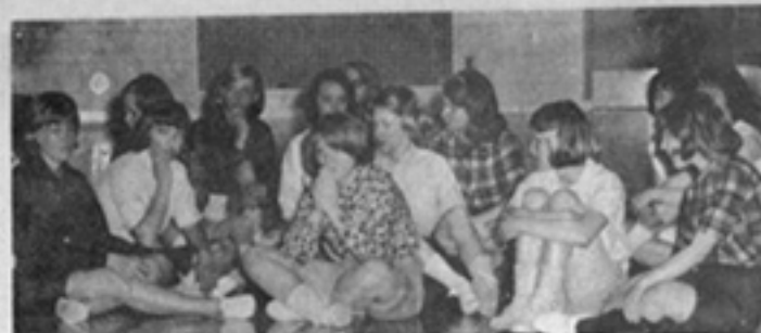
GIRLS ANXIOUSLY AWAIT THE ANNOUNCEMENT OF THE 1965-66 VARSITY CHEERLEADERS