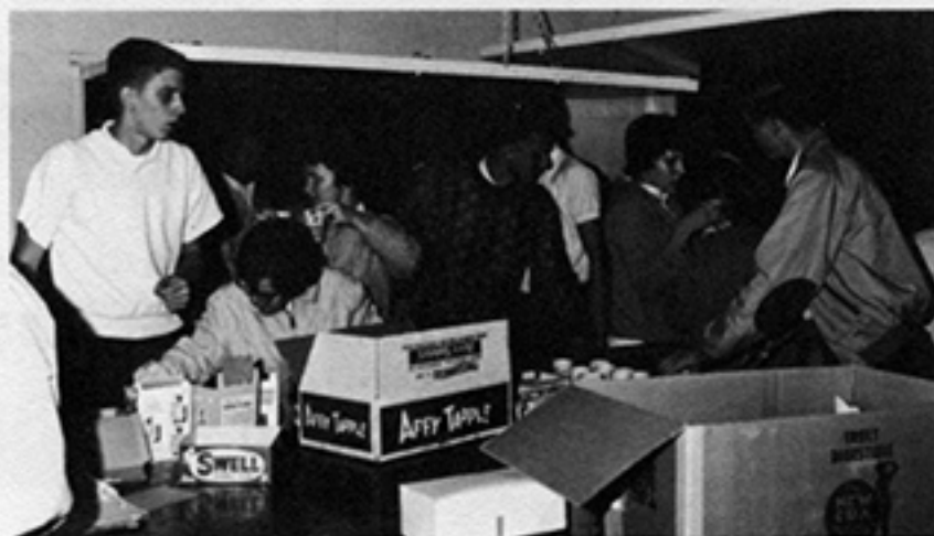
To earn money for the financing of their last all class activity, a week-end trip to the Jack and Jill Dude Ranch, seniors worked frantically in the concession stands during the football and basketball seasons.